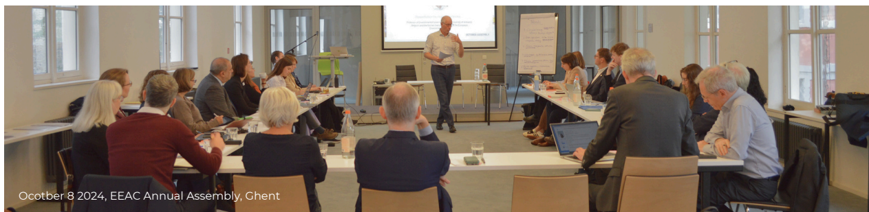
October 8 2024, EEAC Annual Assembly, Ghent

January also saw the (first) annual EEAC roundtable meeting. This meeting was an chance for the councils to update each other on their 2024 activities and 2025 plans. Not only was this a opportunity for councils to connect, but to help ensure that the EEAC can organise events for 2025 that suit both councils' activities and interests. This online meeting was organised after much enthusiasm was expressed for more council updates during the October Assembly 2024.