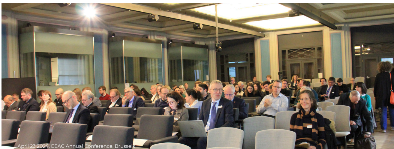
April 23 2024, EEAC Annual Conference, Brussels

The annual EEAC assembly, this year held in Brussels, will focus on the Commissions push towards competitiveness and simplification and what this means for advisory councils. Specific topics of discussion will be on energy and the circular economy, agriculture and water, and health and well-being.